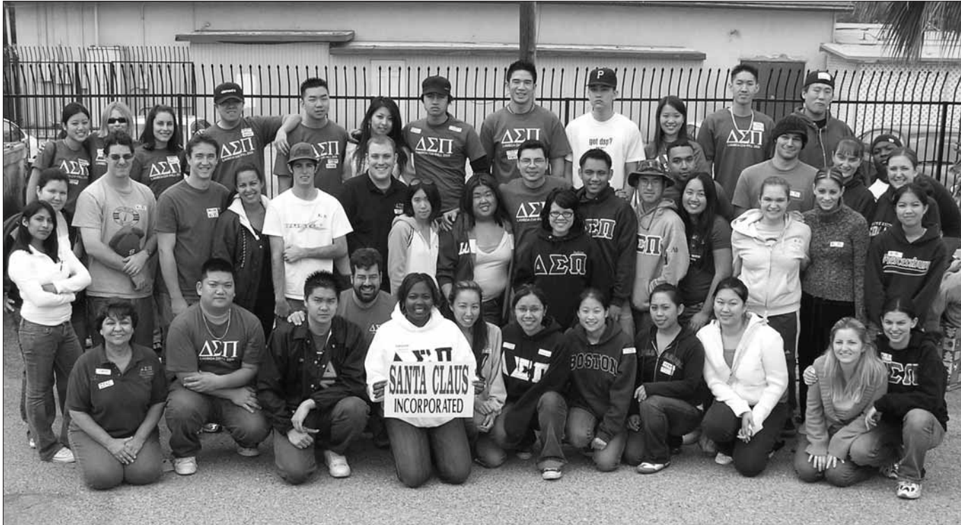
Brothers from CALIFORNIA-RIVERSIDE, REDLANDS, CAL STATE-LONG BEACH, CAL STATE-FULLERTON, and the INLAND EMPIRE Alumni Chapter came together to aid underserved children by volunteering at Santa Claus, Incorporated of Greater San Bernardino.